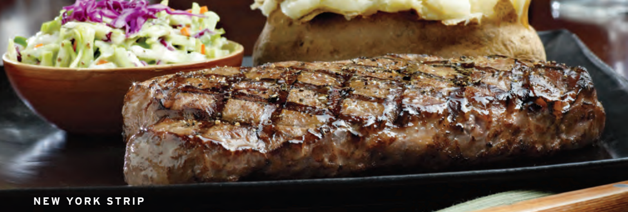
NEW YORK STRIP