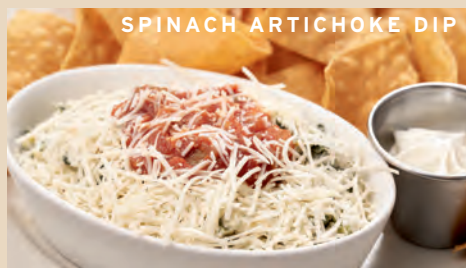
SPINACH ARTICHOKE DIP

BREADED CALAMARI Tender calamari rings lightly breaded and gently fried. Garnished with diced red onions. Served with tzatziki sauce. 19