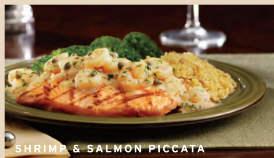
SHRIMP & SALMON PICCATA

Salmon filet topped with shrimp in a lemon caper wine sauce. Served with rice pilaf and fresh broccoli. 38