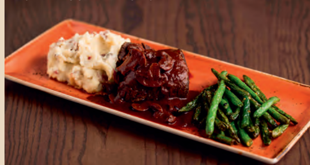
BONELESS BEEF SHORT RIB