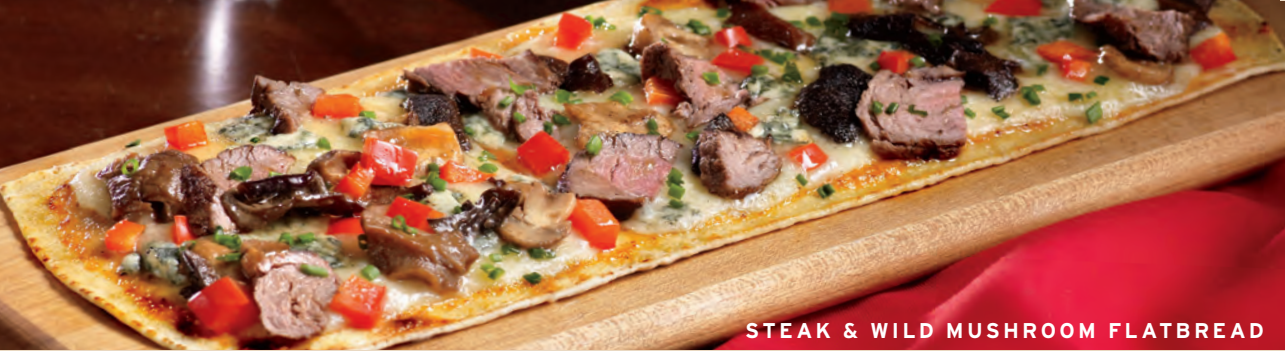
STEAK & WILD MUSHROOM FLATBREAD